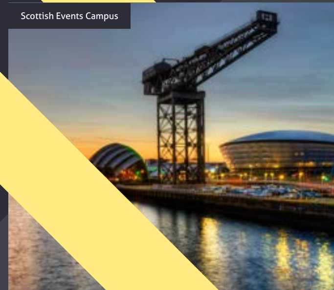
Scottish Events Campus