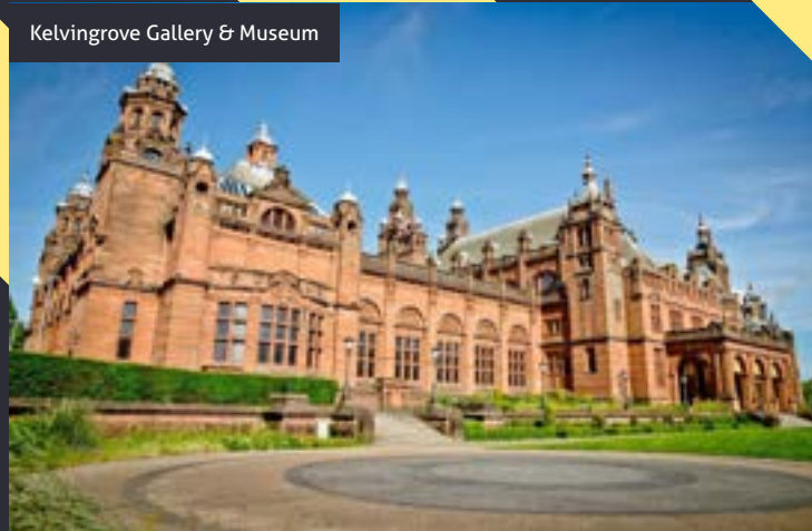
Kelvingrove Gallery & Museum