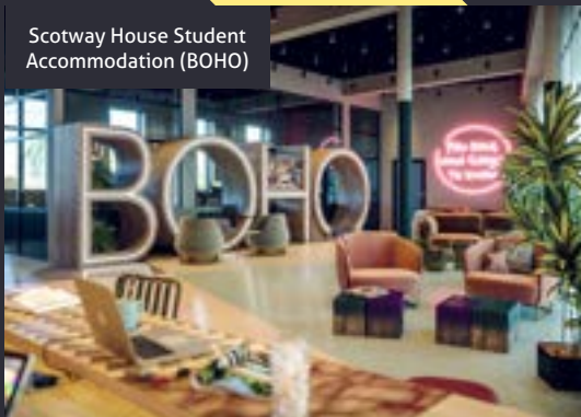
Scotway House Student Accommodation (BOHO)